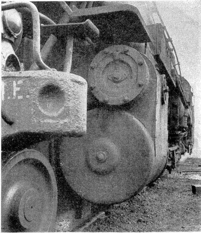
The bar of metal shown below the cylinder is an end of receiving coil

used, the loud-speaker is cut out. The set is normally in receiving condition when turned on.