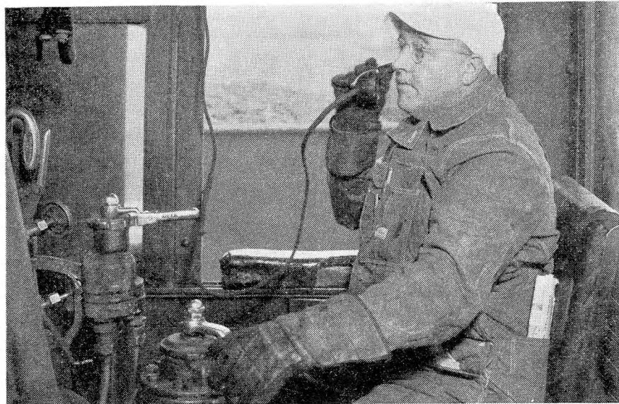
Engineman using the train telephone to talk with a block operator miles away

of axles for cracks, Sperry apparatus for detecting flaws in rails, and the like.